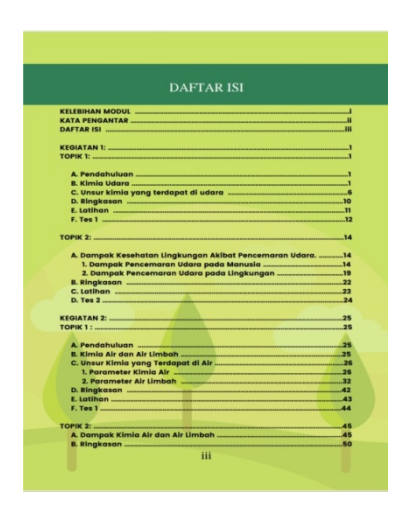
Figure 2. Table of Contents Design

preparing the environmental damage module. This stage begins by looking for references related to environmental damage and discussing the health impacts caused by environmental pollution. The second stage is the media selection stage. The environmental conservation module developed was created using one of the online graphic design applications, namely the Canva application, which can be used to design various types of creative designs such as magazines, books, invitations, brochures and so on. Canva is used by researchers in developing environmental damage modules because it is based on the researchers' own abilities in designing the module, including practical laboratory-based work module for general chemistry for university students [7], and e-module for science practicum for teachers and high school students [8]. Canva is used by researchers in developing environmental damage modules because it is based on the researchers' own abilities in designing the module. The third stage is determining and selecting the format. This stage determines the size of the module that will be used and is done by looking at what students need. Therefore, it can make it easier for students to understand the contents of the module. In general, one of the displays in this environmental conservation module is as following Figure 2.